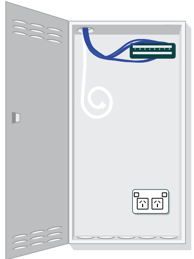
Internal communications box